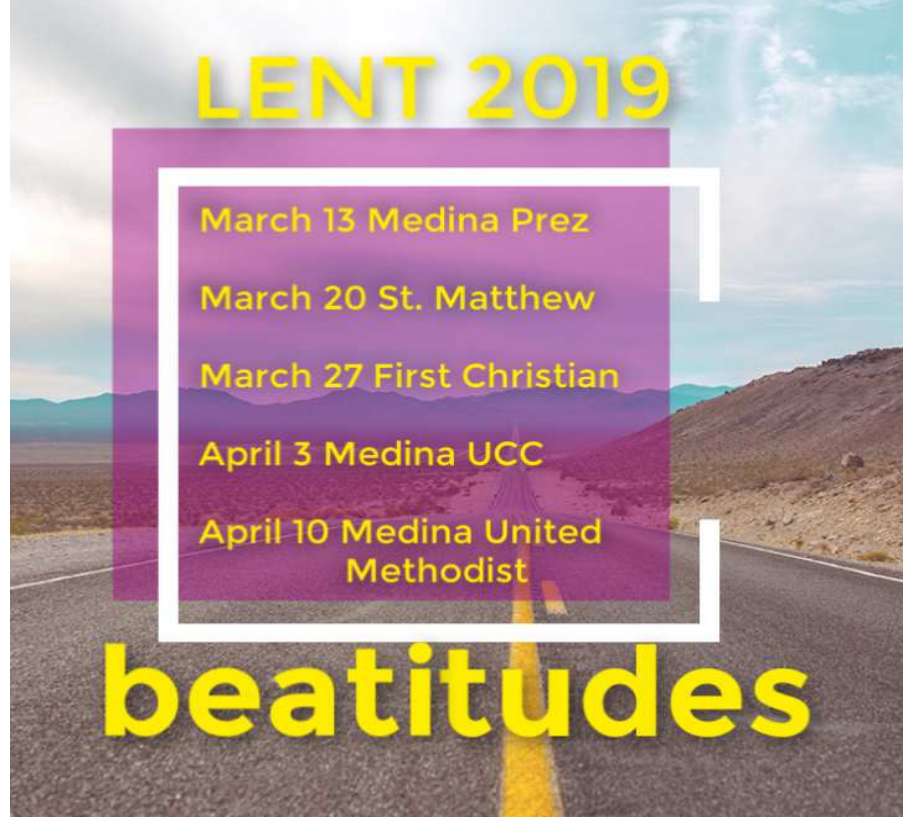
There will be childcare available on April 3<sup>rd</sup>

March 13: Medina Presbyterian, 5020 Burgundy Bay Blvd March 20: St. Matthew Lutheran, 400 N Broadway St March 27: First Christian, 4797 Sharon Copley Rd April 3: Medina United Church of Christ Congregational, 217 E Liberty St April 10: Medina United Methodist Church, 4747 Foote Rd