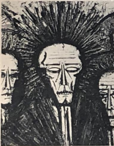
Detail of The Last Supper , oil on canvas by Bernard Buffet, France, 1961.