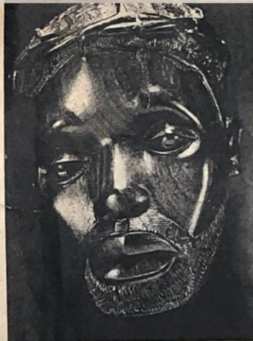
—Christ with the Crown of Thorns, a 20th-century African wood carving.