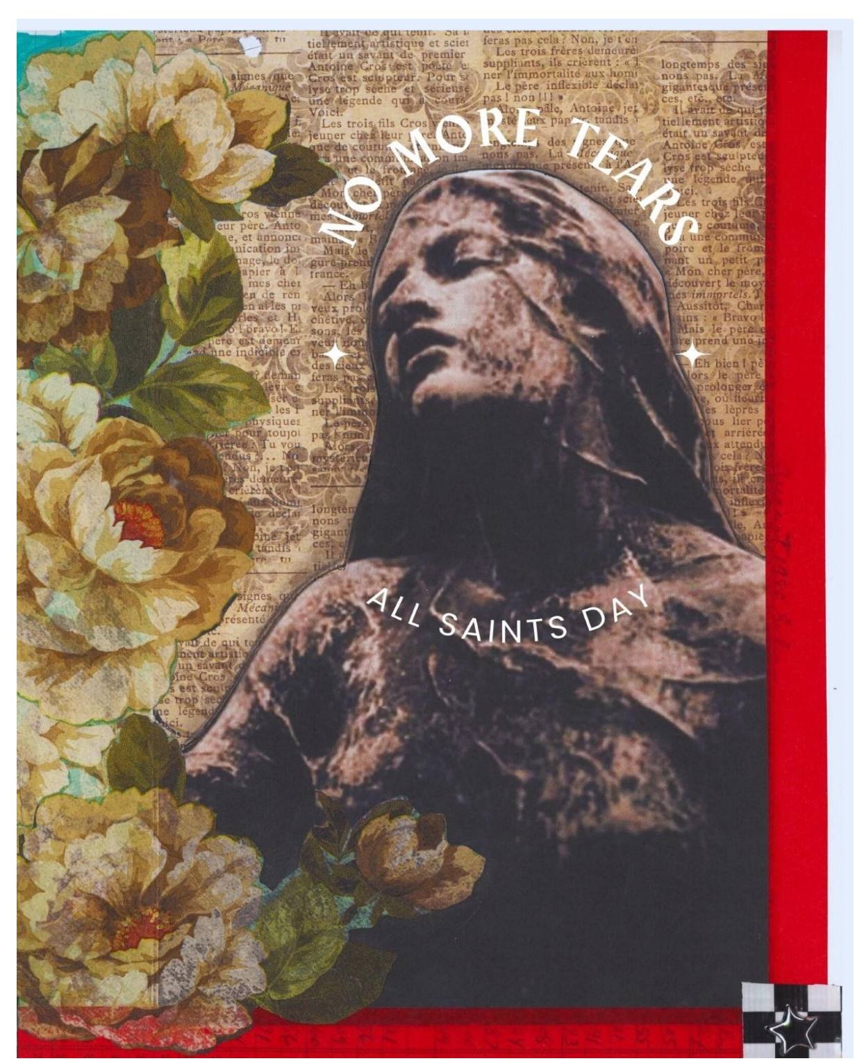
October 29, 2023 – 10:30 a.m.